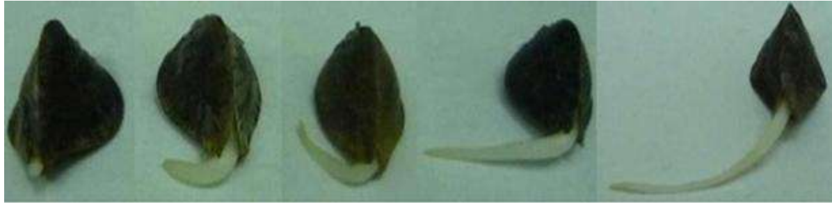
22 hours 24 hours 26 hours 29 hours 31 hours

Sprouting was carried out in an experimental laboratory facility at the Department of Biotechnology of fermentation and winemaking National University of Food Technologies at different temperatures - 14, 16 and 18 ° C. Buckwheat malt obtained by using pre-selected mode soaking namely, air-water soaking method - 4:00 buckwheatkept under water, air break 6:00. Temperature control germinating grains systematically carried out at 2 hours at different depths layer malt. In terms of dissolution endosp Ermou mode 4-6 and temperature 16 ° C were optimal because when grinding the endosperm buckwheat has a floury consistency. Higher temperatures germination is not used because itis known that at a temperature of 18 ° C and above [3] in grain sharply activated processes of growth and development, increasing the level of oxidative process in which results in reduction of reserve substances that negatively affects the extract of malt . Also at higher temperatures is outside the intensive development of microorganisms that on the one hand inhibits the physiological processes in the grain, and the other leads to the loss of dry matter that goes to microorganisms. resulting in the quality of state of the maltdecreases. Visually, the degree of germination of buckwheat can be judged by the length of shoots (Figure 1). This visual criteria can be used to determine the completion germinating of maltbuckwheat.